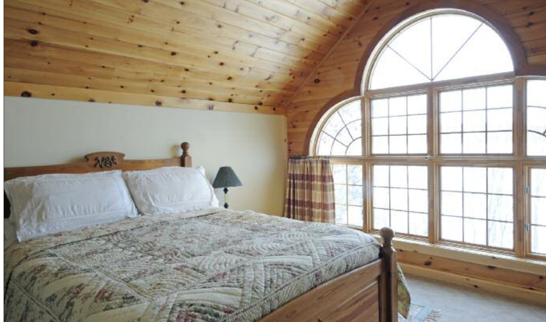
Large windows occupying almost an entire wall of the Clark's bedroom give the space a natural, bright feel (above). The master bathroom is Jan's oasis and the first place she heads after a day of skiing or snowmobiling (below).

Midland, Ont. and all the British guests were accommodated in a cottage on an island.