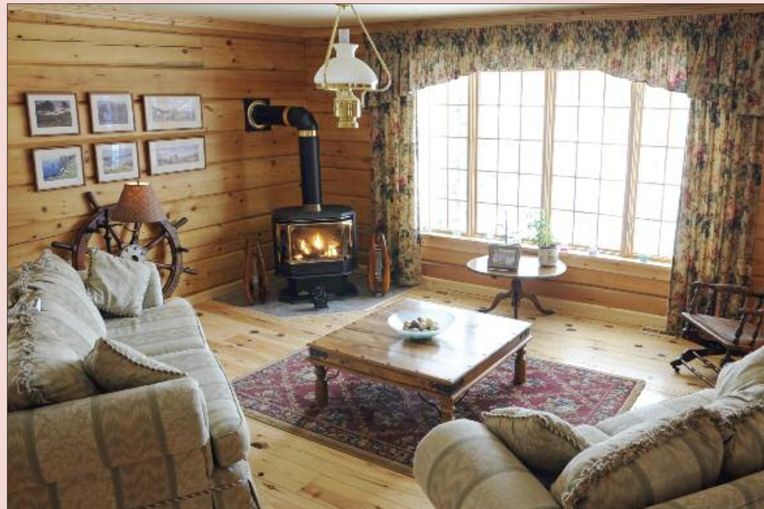
A wood stove in the living room, as well as one in the sunroom, keeps the Clark's log house warm in winter.